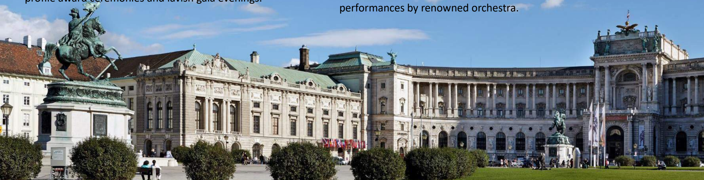
© Hofburg Vienna, Photo M Seidl: © Hofburg Vienna, Graphic & Text

On average, the venue hosts a total of approximately 30 concerts performances by renowned orchestra.